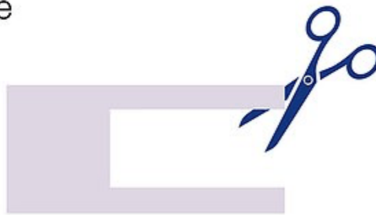
Cutting the tie strings

Step 3: Cut down towards the bottom of the fabric until you reach approximately 2cm above the bottom edge. From here, make another 15cm cut that runs parallel to the bottom of the fabric to make a rectangle that can be discarded.